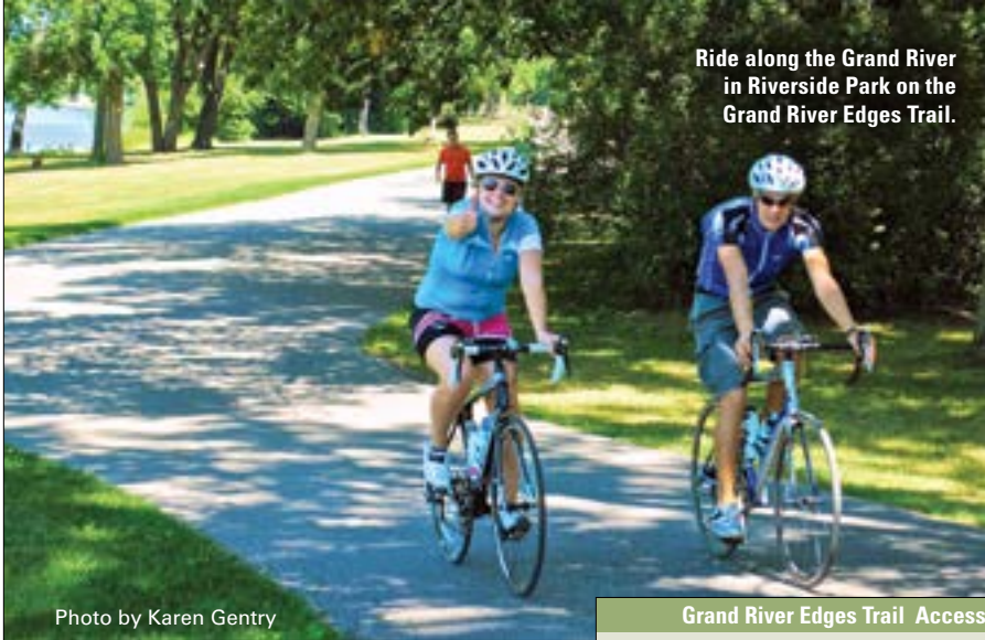
Ride along the Grand River in Riverside Park on the Grand River Edges Trail.